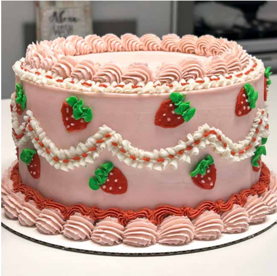
Whimsical strawberry decorations adorn this custom cake.

the holidays, and I love putting them together.”