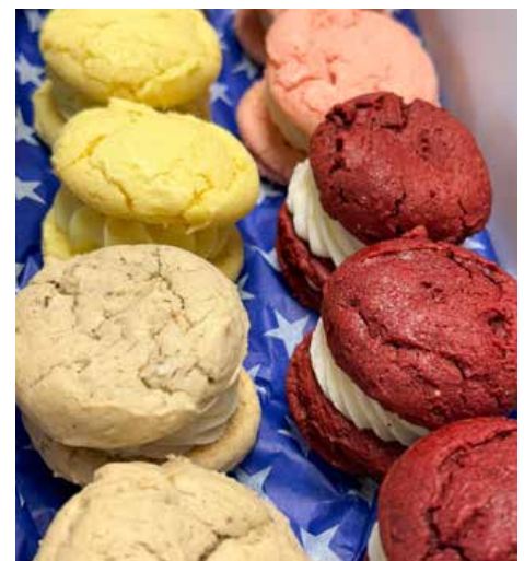
Generously filled whoopie pies are always a favorite.