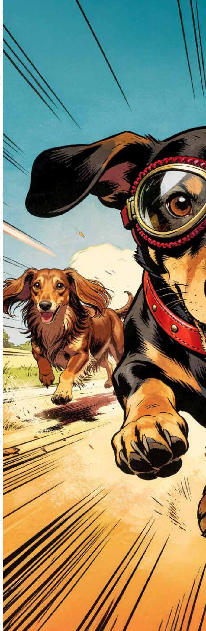
AI-generated image by Brandon Pomrenke/FreePik

The chamber is considering moving PAW Palooza to April, as September can be a little steamy for tiny-legged racers so close to the ground. For updates, find PAW Palooza & Wiener Dog Race on Facebook. 📱